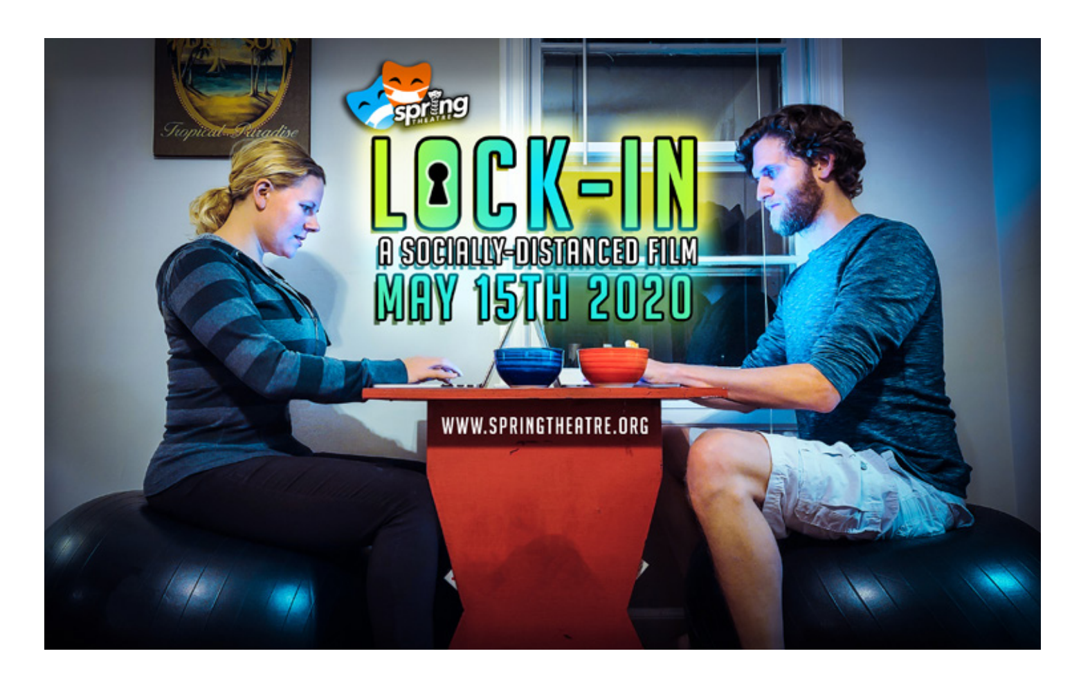
April 14, 2020: FOR IMMEDIATE RELEASE